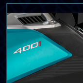
Peugeot PowerMotion® 400cc engine manufactured in France