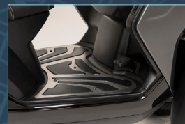
Stainless steel floor assembly A08009