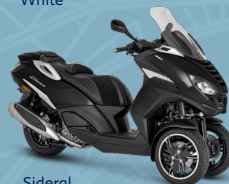
Sideral Mat Black