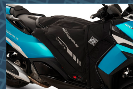
Rider apron (2) A08079