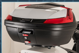
Top case 47L matched to vehicle colour A05892XX