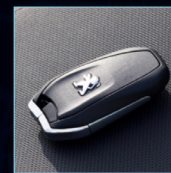
Smart Key for hands-free ignition