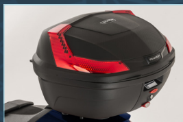
Top case 47L plain black A05890N

For even more comfort, we have designed for you a whole range of additional equipment. Our selection is below. More equipment is available on our website.