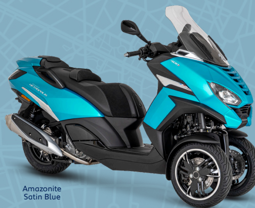
Amazonite Satin Blue