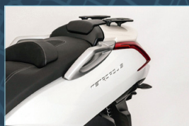
Top case support A08010