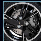
ABS-SBC braking (1)